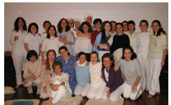
3HO WOMEN Course Bologna 3.03