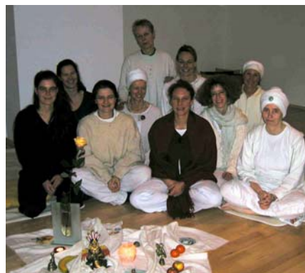
3HO WOMEN Course Hamburg 2.03