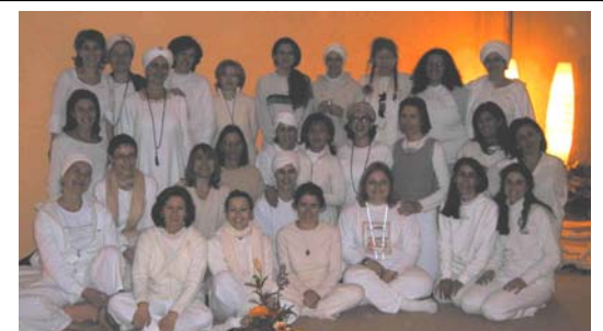
3HO WOMEN Course Rome 3.03